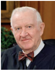
The Collection of the Supreme Court of the United States